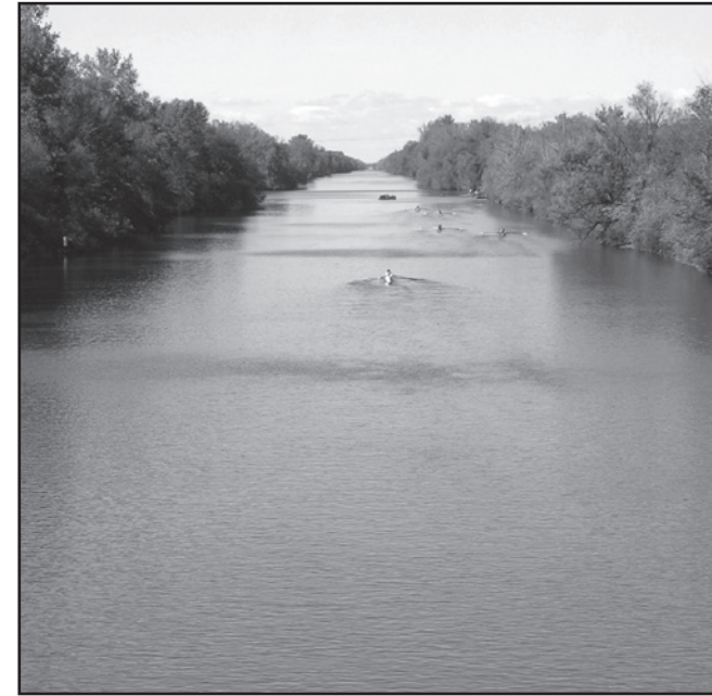
The Erie Canal

The fall season starts on Oct. 8 with Hamilton's Bridge-to-Bridge Head Race on the Erie Canal. Hamilton races in Boston (Head of the Charles) and Philadelphia (Head of the Schuylkill) later that month. The spring season features a two-week training trip during spring break in March. Hamilton traveled to Tampa, Fla., in 2011 and competed in the Tampa Mayor's Cup for the second straight year. The New York State championships and the ECAC championships also highlight the spring schedule.