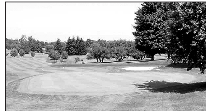
The Skenandoa Club, where Hamilton golfers practice on a daily basis.

Hamilton College has had ties with the Skenandoa Club since its inception in 1890, when six Hamilton graduates were part of a group of 12 Clintonians to organize what started as a social club. Skenandoa has hosted a number of Hamilton tournaments, including the final round of the 2010 Fall Invitational, and the 2009, 2010 and 2011 Spring Invitationals. Skenandoa was the site of the 2007 New England Small College Athletic Conference (NESCAC) Championship Qualifier, which was a two-day, 36-hole event.