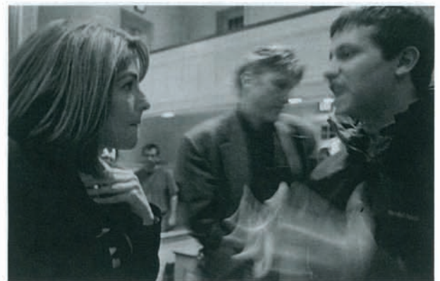
Naomi Klein (left) with Hamilton student.

On Monday, April 13, award-winning journalist Naomi Klein presented a lecture on her best-selling book, The Shock Doctrine: the Rise to Disaster Capitalism . The event was co-sponsored by the Kirkland Endowment and the Dean of Faculty. Klein began by outlining the contemporary economic crisis and linking it to her definition of the "shock doctrine" and "disaster capitalism". She noted that the depth, scope and speed of the current crisis have caused a rupture in modern society. Klein then linked her concept of the shock doctrine with history, citing examples from the Great Depression, the rapid deregulation of the financial sector in Latin America, as well as the U.S. economic crisis in the 1970's which gave rise to stagflation. According to Klein, crises such as September 11th and the Iraq War inhabited all the trappings of the shock doctrine. She noted that by examining past examples of disaster capitalism, our society must work to combat the effects of the shock doctrine.