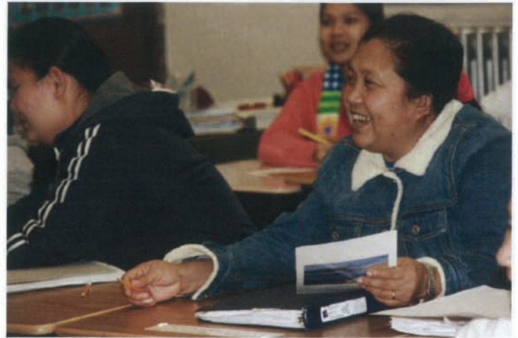
Adult learners in an ESOL class at the Utica City School District's Adult Learning Center

Project SHINE (Students Helping in the Naturalization of Elders) completed its sixth year as a service-learning program of the Levitt Center. Project SHINE is a national service-learning program that seeks to form intergenerational and intercultural ties between college students and elder immigrants and refugees. Participating Hamilton College students spend approximately 20 hours over the semester assisting adult immigrants and refugees in ESOL (English for Speakers of Other Languages) and Citizenship Classrooms. This year six professors offered Project SHINE in ten classes in the Anthropology, Education, Government, and Women's Studies Departments. Ninety-two students participated in Project SHINE during the 2008-2009 school year completing nearly 1,700 hours of service.