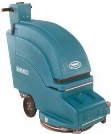
Battery Powered Walk Behind Model