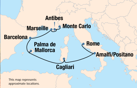
This map represents approximate locations.